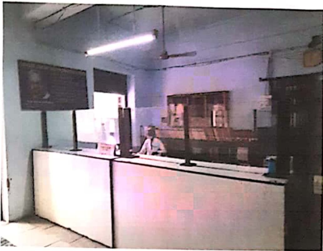
BOOK ISSUE RETURN COUNTER