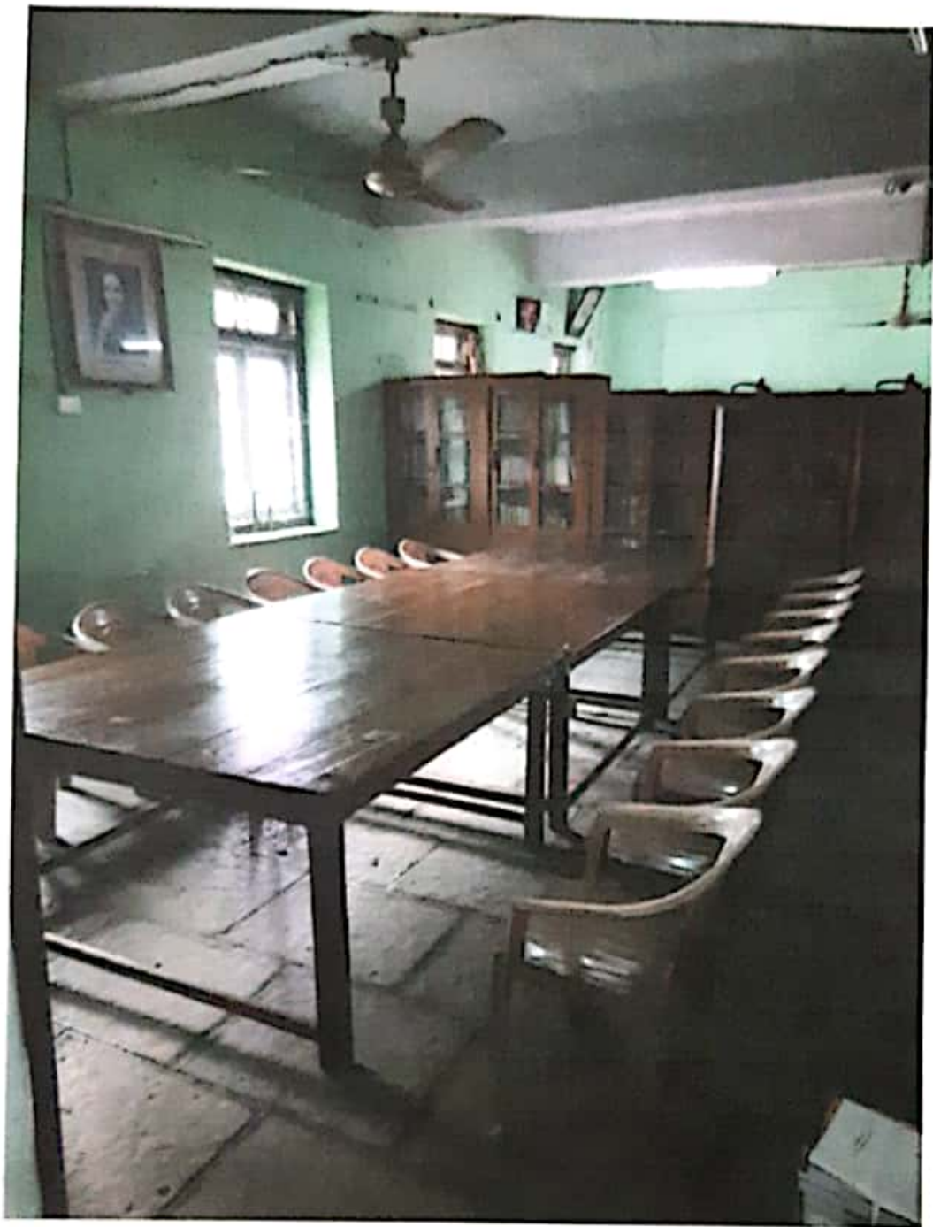
LIBRARY READING ROOM