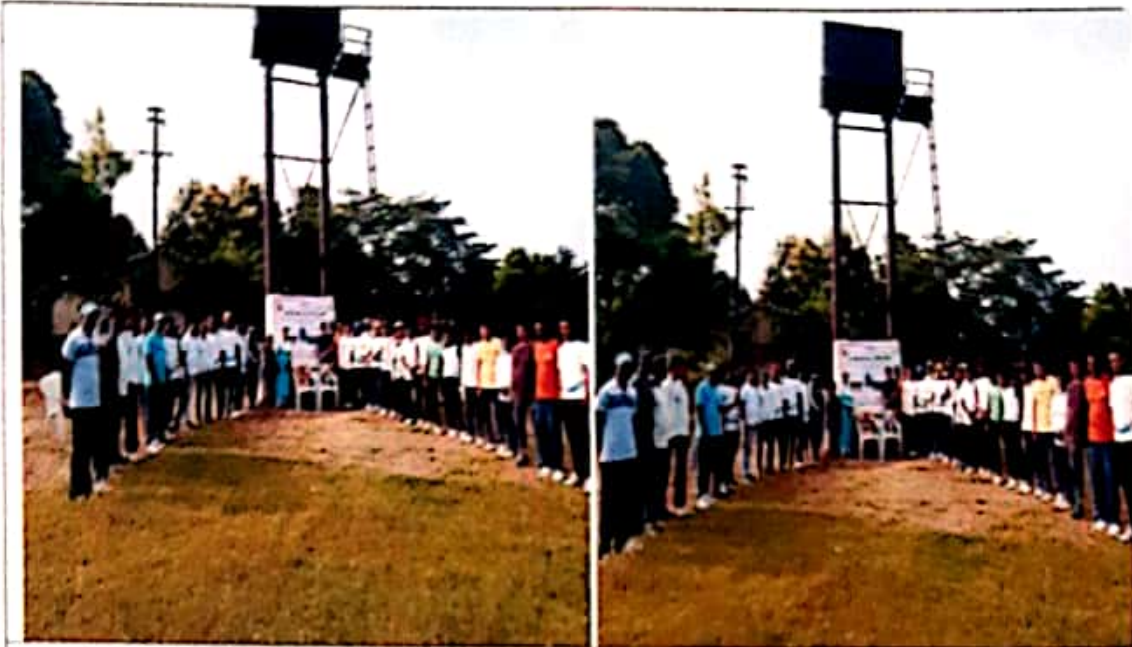
Matoshree Vimalabai Deshmukh Mahavidyalaya, Amravati, Department of sports and Physical Education Organized the "Fit India Program" on the occasion of Major Dyanchand's Birth Anniversary, celebrated as a National sports day on 29 AUGUST 2021.