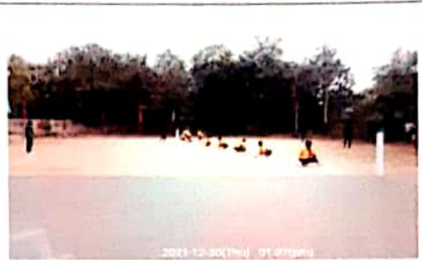
Kho-kho players playing a game at the occasion of "University Inter collegiate women's KHO-KHO" tournament organized by the Department of sports and Physical Education Matoshree Vimalabai Deshmukh Mahavidyalaya, Amravati on dated - 30 Dec 2021 to 02 Janu. 2022