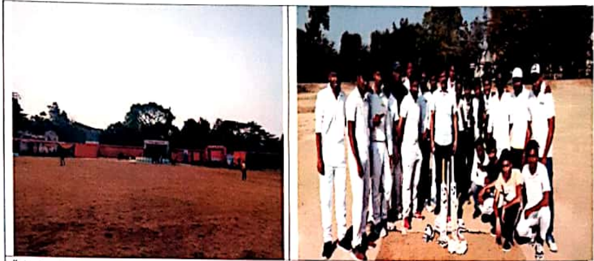
"University Inter collegiate Cricket" tournament organized by the Department of sports and Physical Education, Matoshree Vimalabai Deshmukh Mahavidyalaya, Amravati on their own Ground