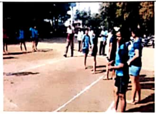
“University Inter Collegiate “Women’s Kabbadi Tournament ” organized by the Department of sports and Physical Education, Matoshree Vimalabai Deshmukh Mahavidyalaya, Amravati.