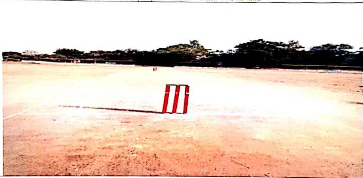
Matoshree Vimalabai Deshmukh Mahavidyalaya, Amravati's own Ground.