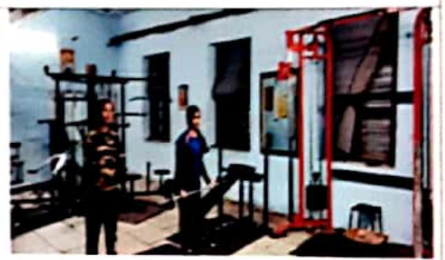
Students of B. Sc. II (Home Science) , Matoshree Vimalabai Deshmukh Mahavidyalaya, Amravati, availing the facility of power lifting in Gym.