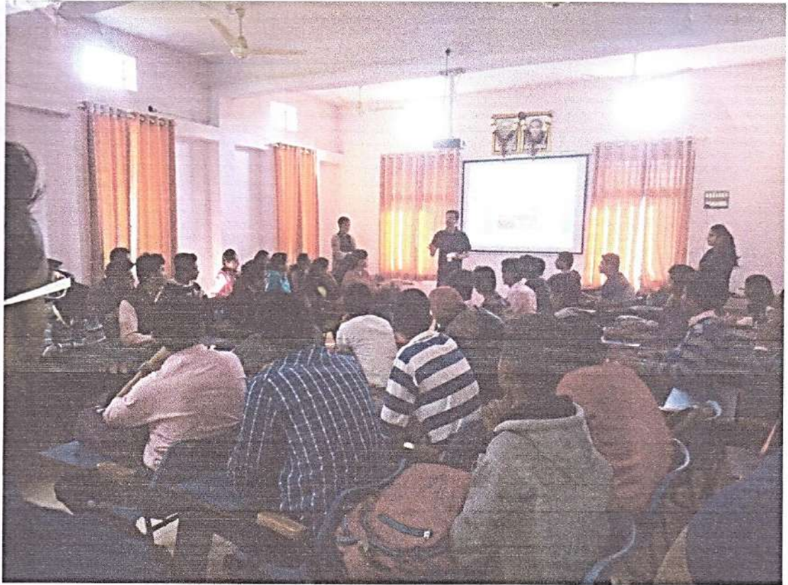
AUDIO VISUAL CLASS ROOM