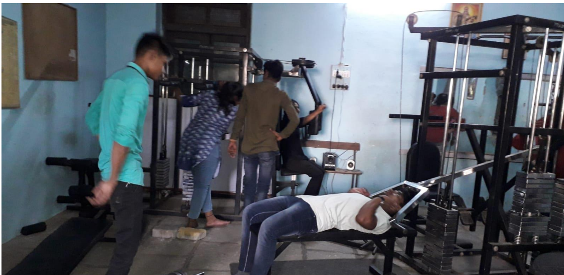
Instruments presents in Gym of Matoshree Vimalabai Deshmukh Mahavidyalay, Amravati